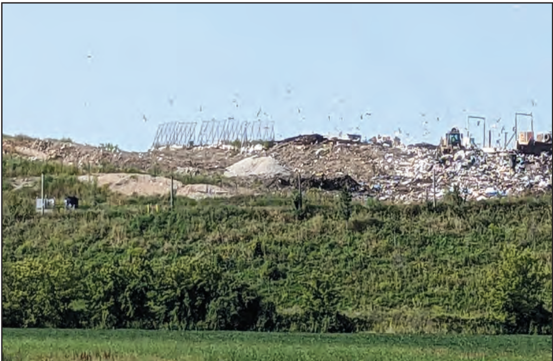
Phase 4 placing waste in Northeast corner