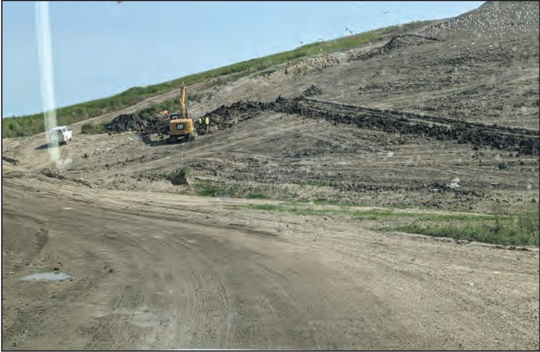
Header for gas collection in cap construction