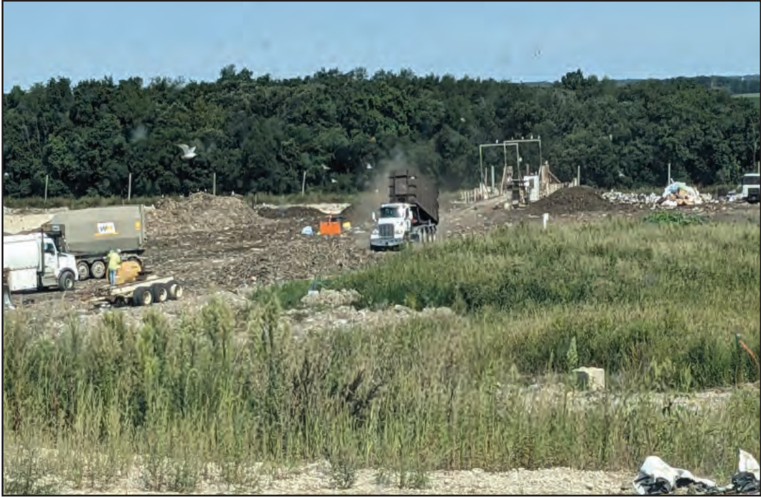
Working face between tipping trucks