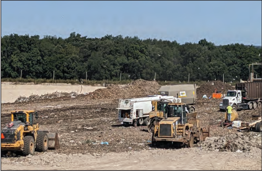
Active area in Phase 4. Stockpiled wood waste and auto-fluff