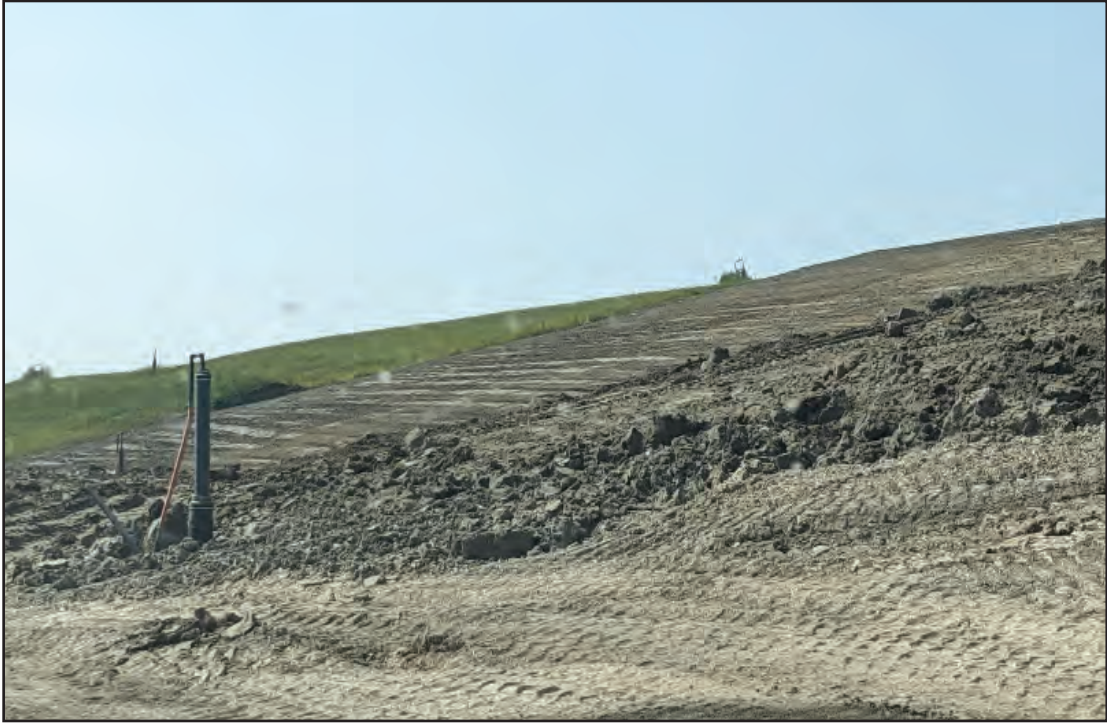
Cap cover soils over plastic cover