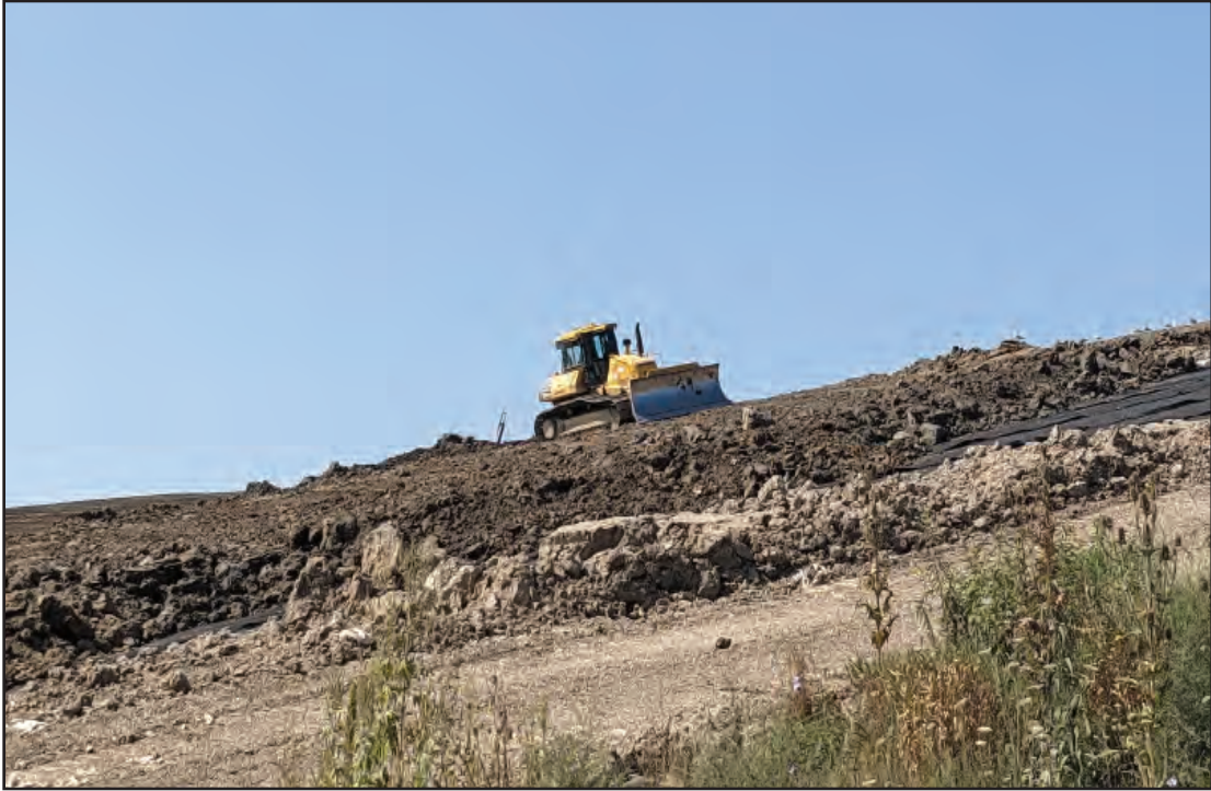
First lift of soil over plastic cap placement