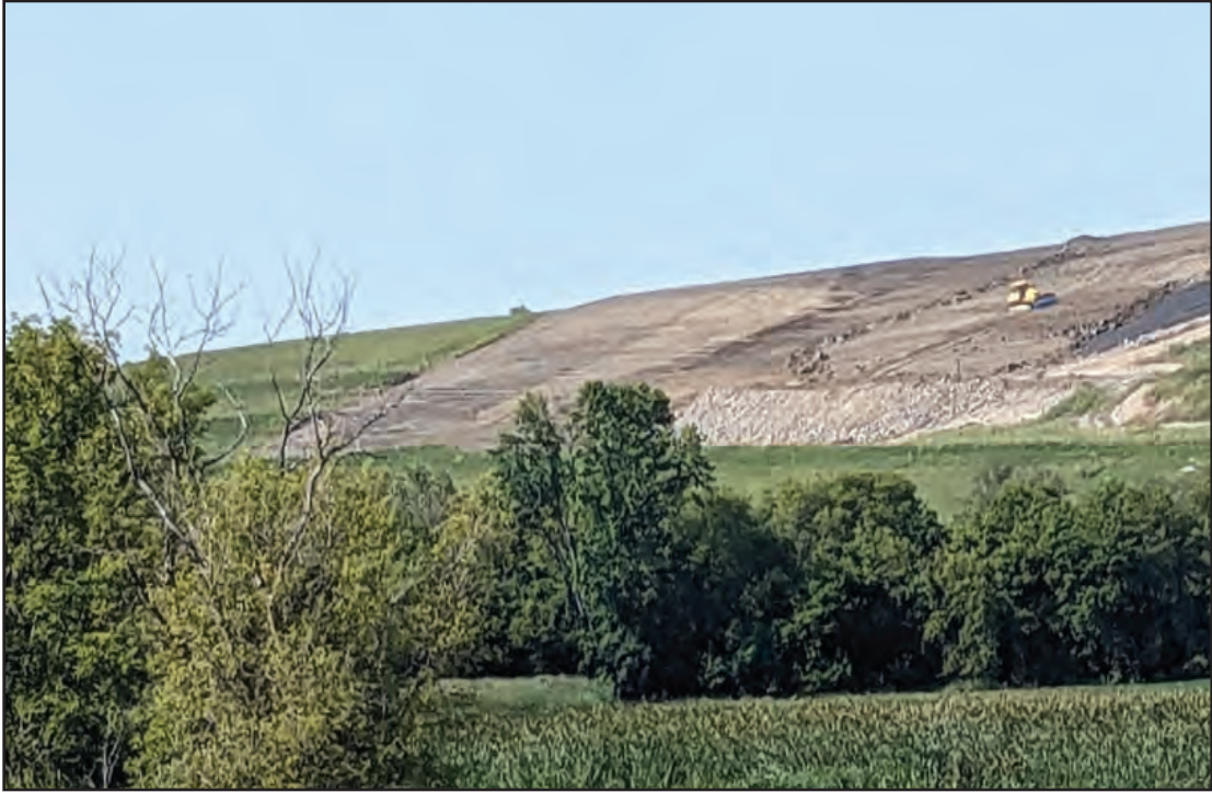
Clay placement over plastic barriers, East slope of Phase 3