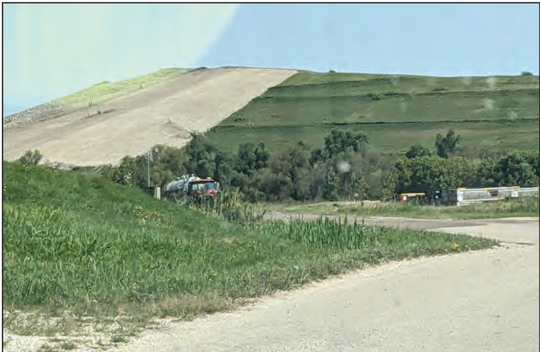
New cap construction up against finished cap