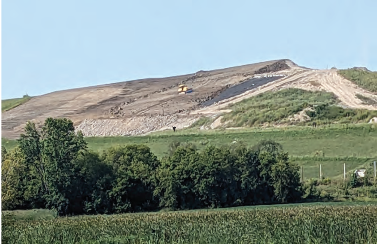
Dozer spreading first lift of soil over plastic cap material, Phase 3 East slopes