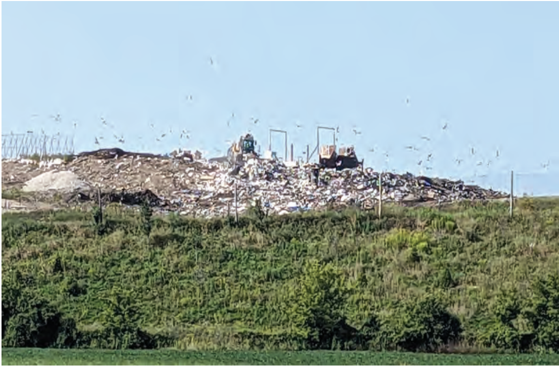
Phase 4 placing waste in Northeast corner