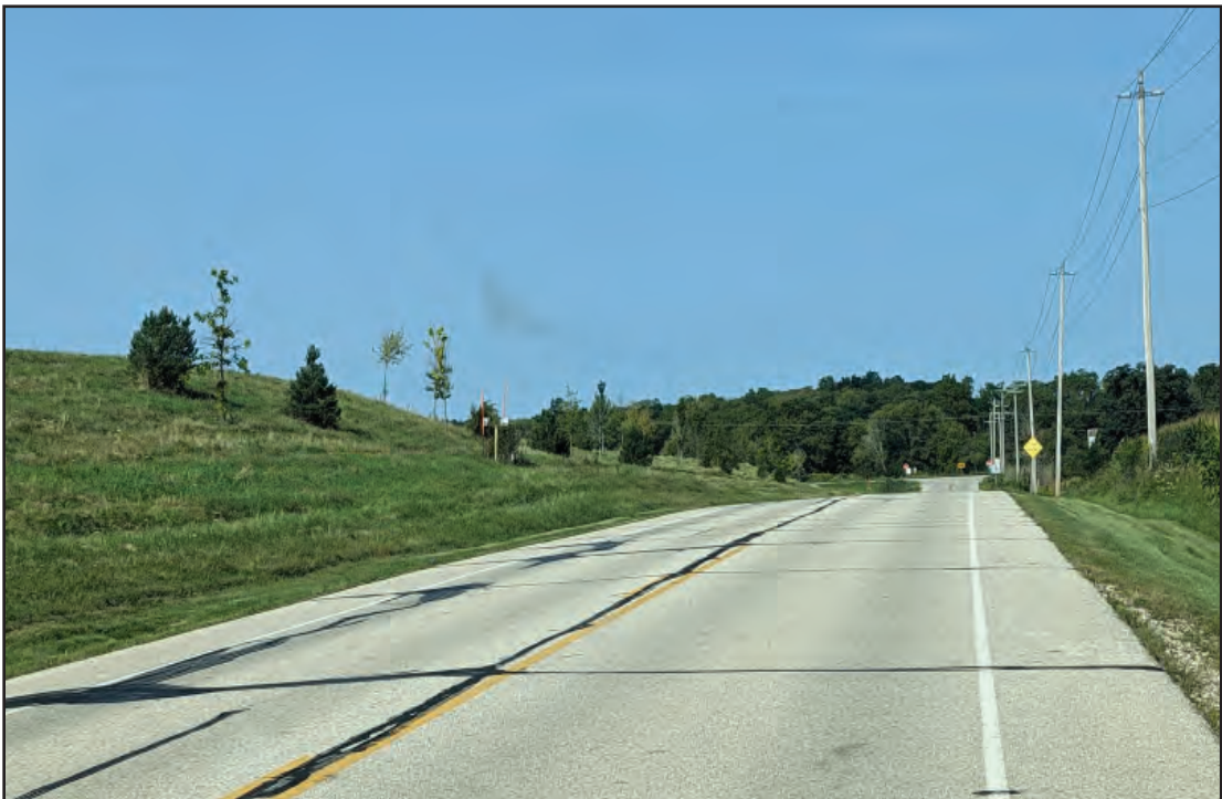
Screening berm along Highway D