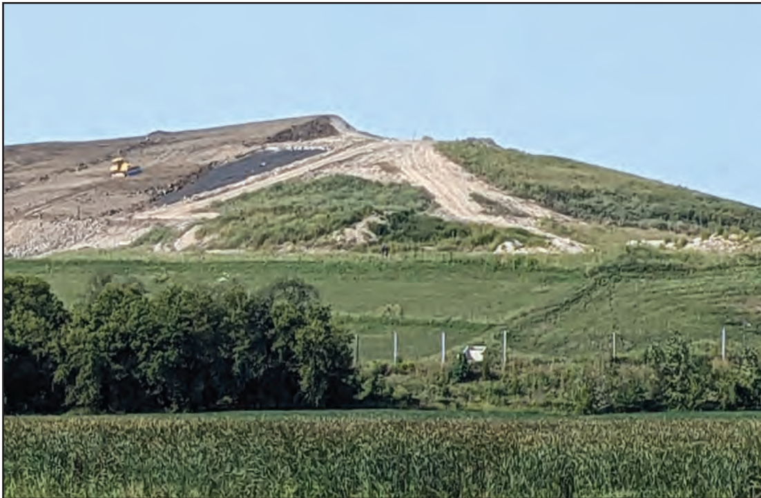
Clay placement over plastic barriers, East slopes of Phase 3