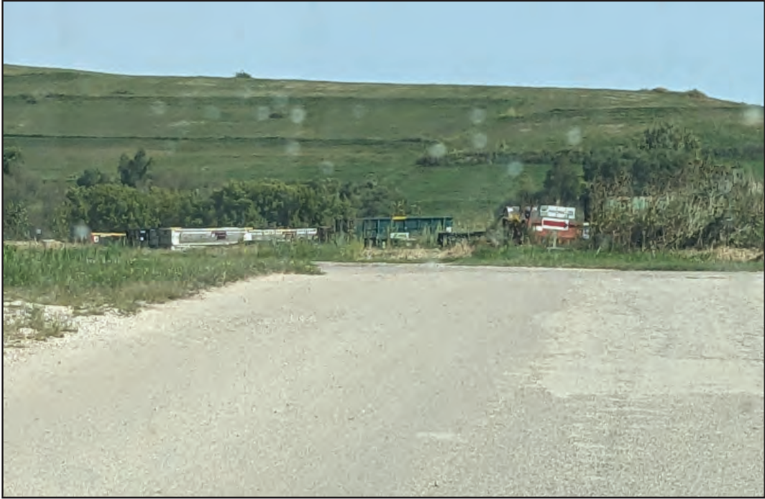
Previously finished cap construction