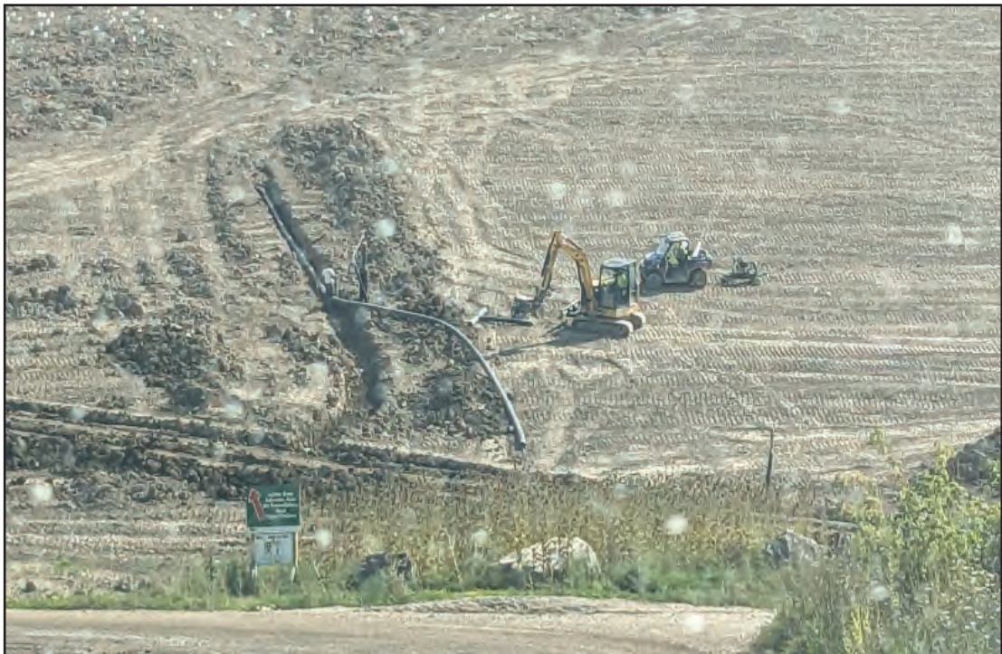
Header for gas collection in cap construction