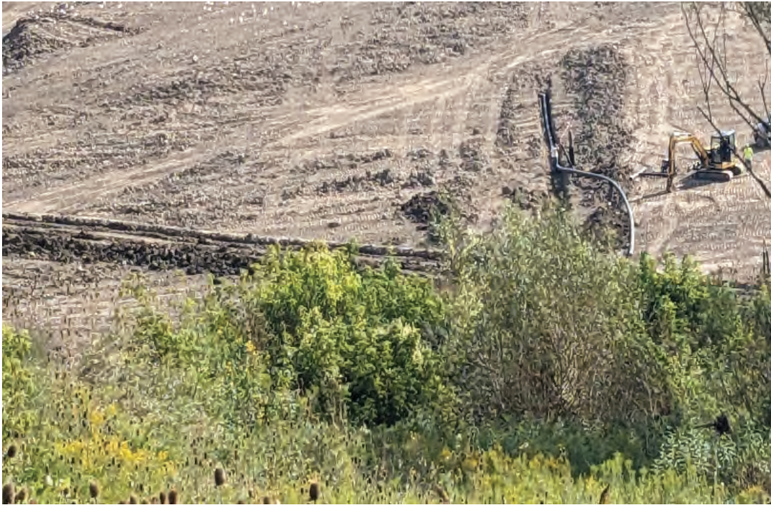
Gas work in new cap project