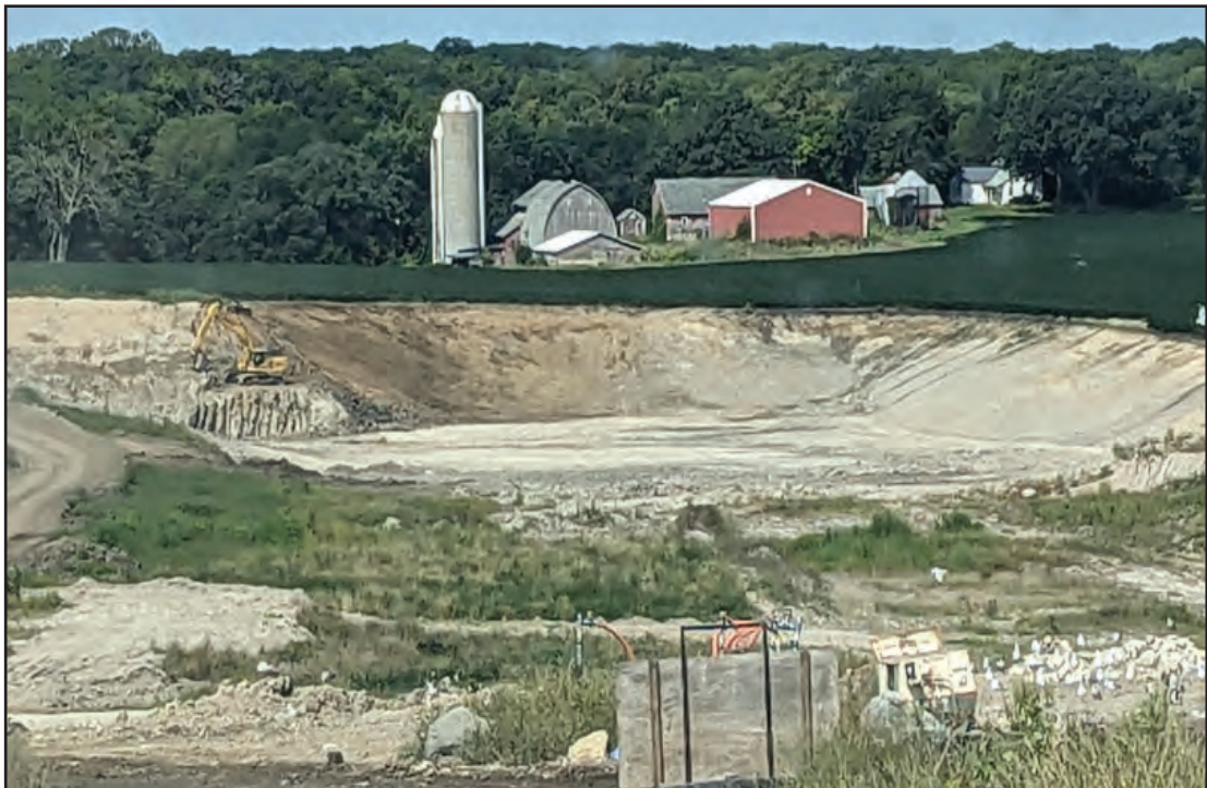
Borrow and future cell area to the West of Phase 4