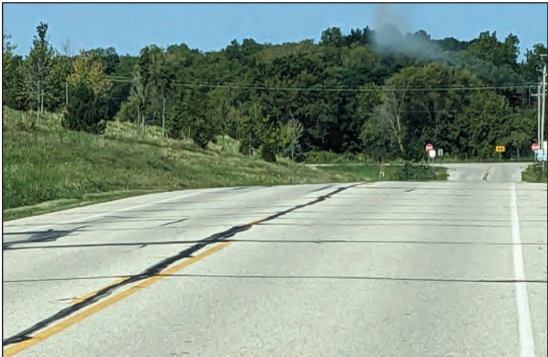
Screening berm along Highway D