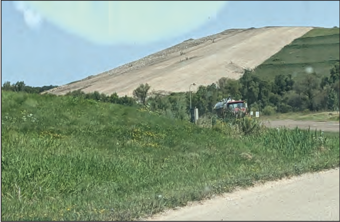
Compactor dealing with empty boxes to incorporate into waste mass