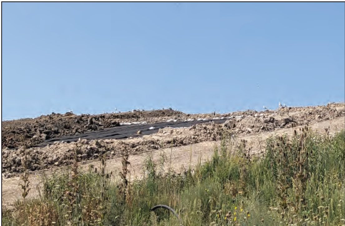
First lift of soil over plastic cap placement