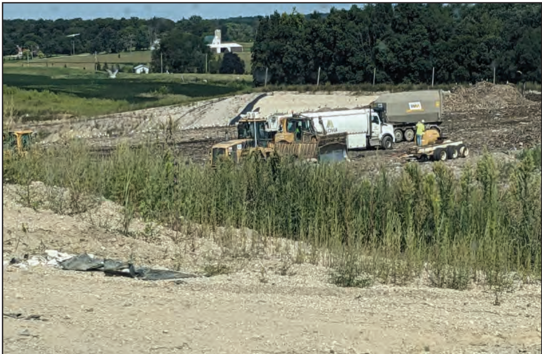
Staging area in Southeast corner of Phase 4