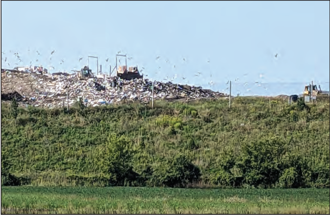
Phase 4 viewed from the Northeast