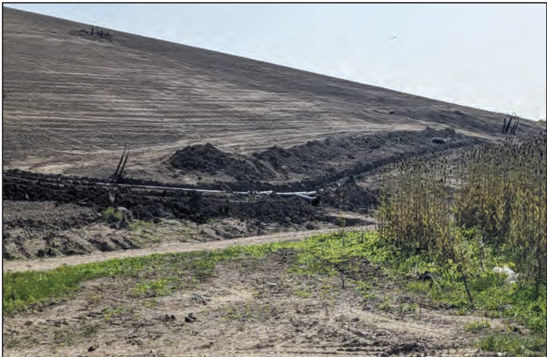
Header for gas collection in cap construction