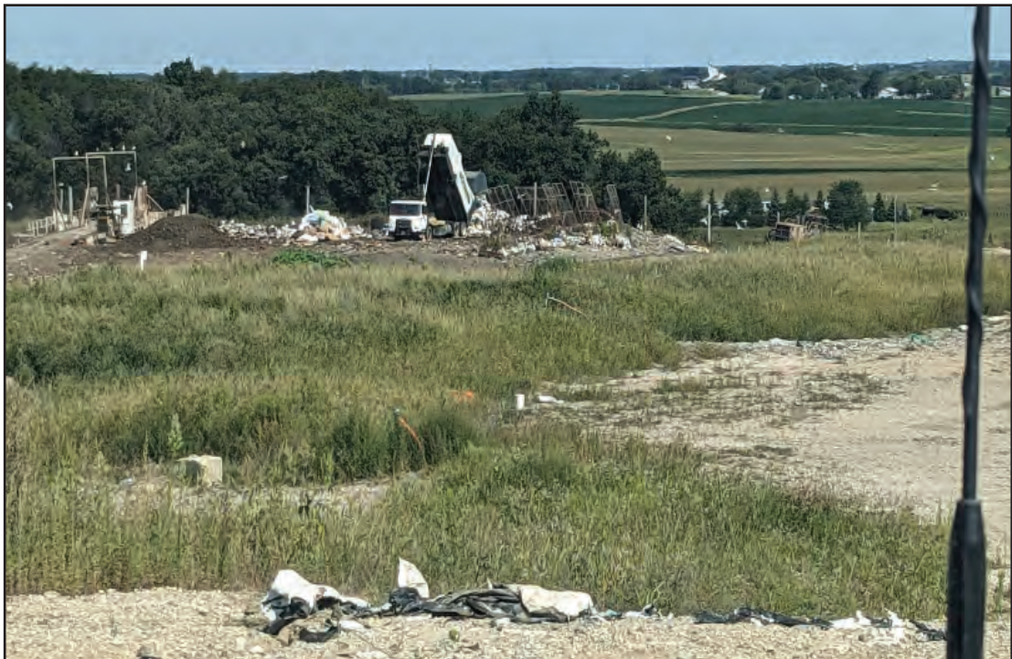
Tipper active in Northeast corner of Phase 4